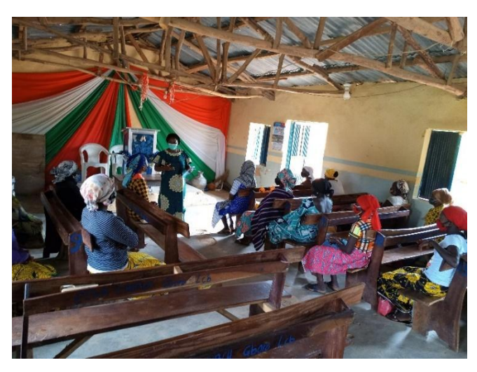
Business training at Gboro community