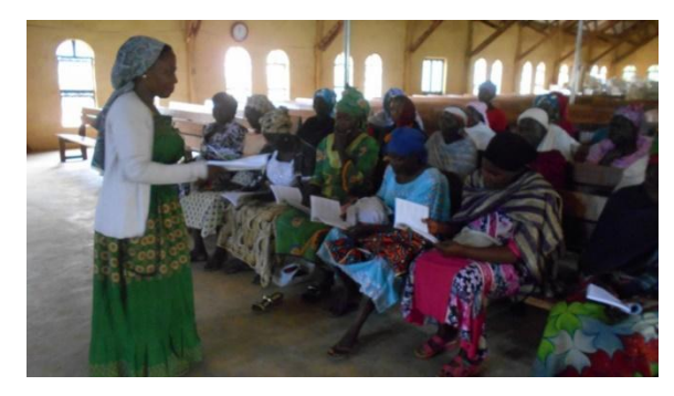
Trauma healing session at Wukari

Beneficiaries of trauma healing continue to express their appreciation for the opportunity to participate. They shared that the sessions provided them with the opportunity to share their pain and pray for one another. Some even shared that they are now able to eat and sleep better. Of note also is the willingness of many beneficiaries to forgive those that hurt them and move on in life with hope.