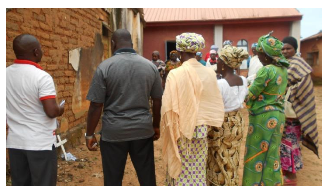
Taking their pain to the cross during a trauma healing session at Kente

The healing sessions were held using the manual "Healing the Wounds of Trauma: How the Church Can Help". BHI continues to encourage beneficiary communities to engage in peace building efforts, promote forgiveness, and reconciliation with their enemies. BHI is helping them find good ways to rebuild their lives and communities.