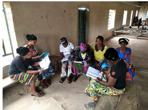
Trauma healing in Zarawuyaku