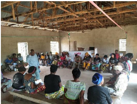
Economic empowerment training at Ngira community

Widows who experienced trauma were reached with entrepreneurship training using Beacon of Hope's Economic Empowerment Training manual. This basic business training provided them with skills on selecting appropriate businesses, record keeping, money management, marketing, development of business plan and savings amongst others. They see the knowledge received as eye opener on how they can utilize local resources for self-help economic ventures with better management skills. They were also provided with business start-up capital of ₦40,000 naira each (estimated $105) where they established or expanded small scale businesses of their choices. Some of these businesses include animal rearing, crop farming, selling of food stuff and grains. Beneficiaries are happy making some income and meeting some of their needs. This has reduced their dependance on others for help. Some shared they were able to help others around them which gives them joy and some sense of purpose.