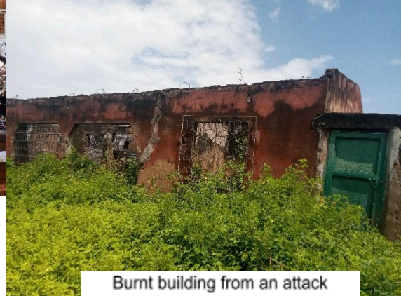
Burnt building from an attack