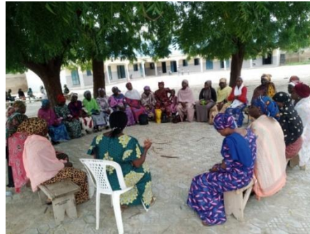
Business training at Potiskum community