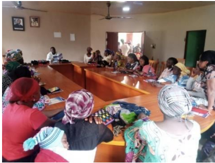
Business training at Tsoje Community

run businesses of their choice. Widows testified that the skills and grants given to them has motivated them to engage in self-help ventures that is generating some income for their households. Beneficiaries are involved in several business activities such as peasant farming, trading, sale of grains/tubers/vegetables/soup ingredients and clothing.