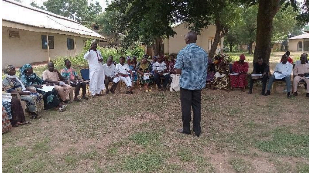
Training with leaders at Kwarhi