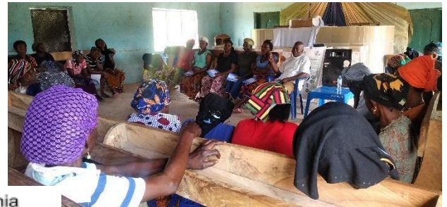
Training at Dapchi