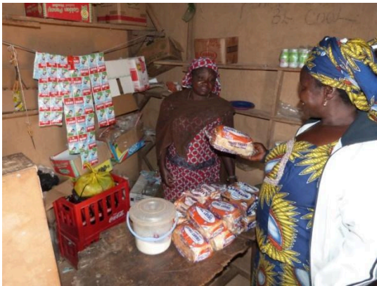
Widow in her poultry in Ribawa Widow in her shop in Bodwai