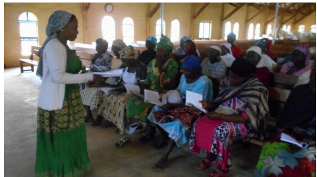
Trauma healing session at Wukari

Beneficiaries of trauma healing continue to express their appreciation for the opportunity to participate. They shared that the sessions provided them with the opportunity to share their pain and pray for one another. Some even shared that they are now able to eat and sleep better. Of note also is the willingness of many beneficiaries