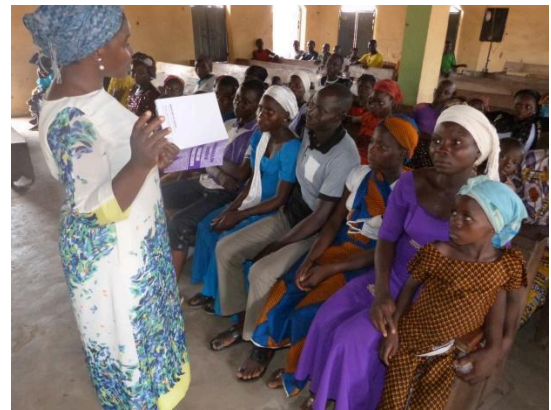
Caregivers training at Igba