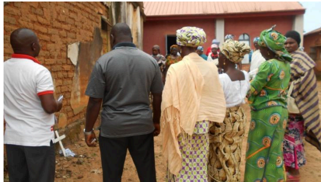
Taking their pain to the cross during a trauma healing session at Kente

The healing sessions were held using the manual “ Healing the Wounds of Trauma: How the Church Can Help ”. BHI continues to encourage beneficiary communities to engage in peace building efforts, promote forgiveness, and reconciliation with their enemies. BHI is helping them find good ways to rebuild their lives and communities.